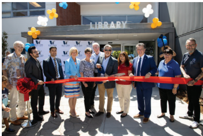
Ribbon Cutting Ceremony on opening day.