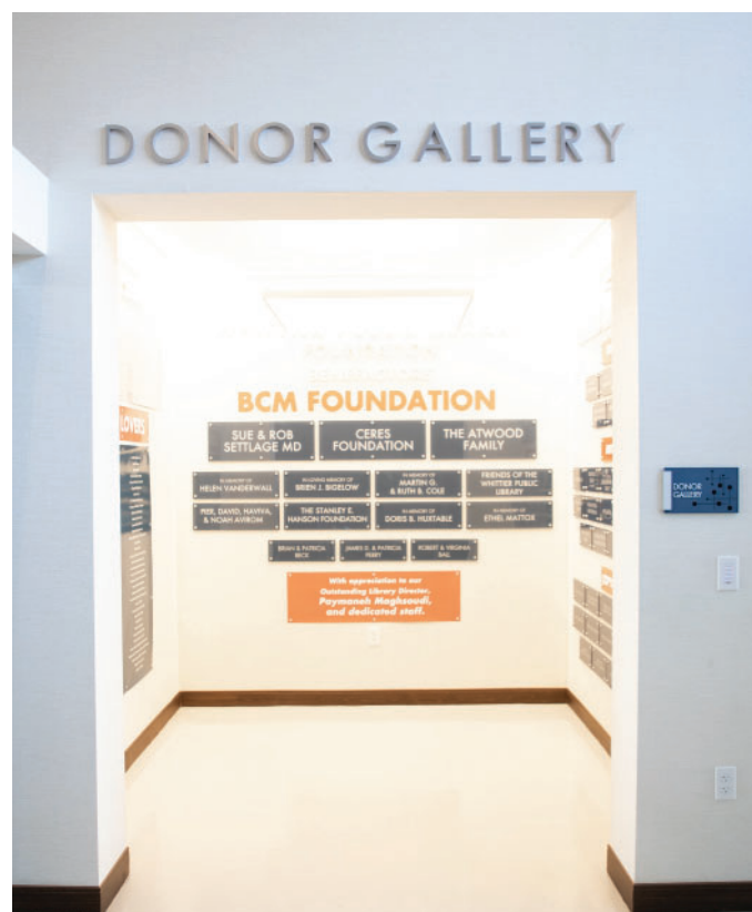
Above: Donor wall inside the library entrance.