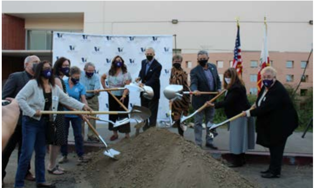
Representatives of the Whittier City Council and the Whittier Public Library Foundation